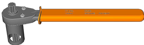
'JTS/71' Universal Screw Ratchet Tool (Insulated)

The appropriate tooling is to be used at all times, typical examples shown below.