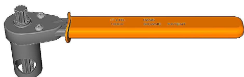
'JTS/7I' Universal Screw Ratchet Tool (Insulated)

The appropriate tooling is to be used at all times, typical examples shown below.